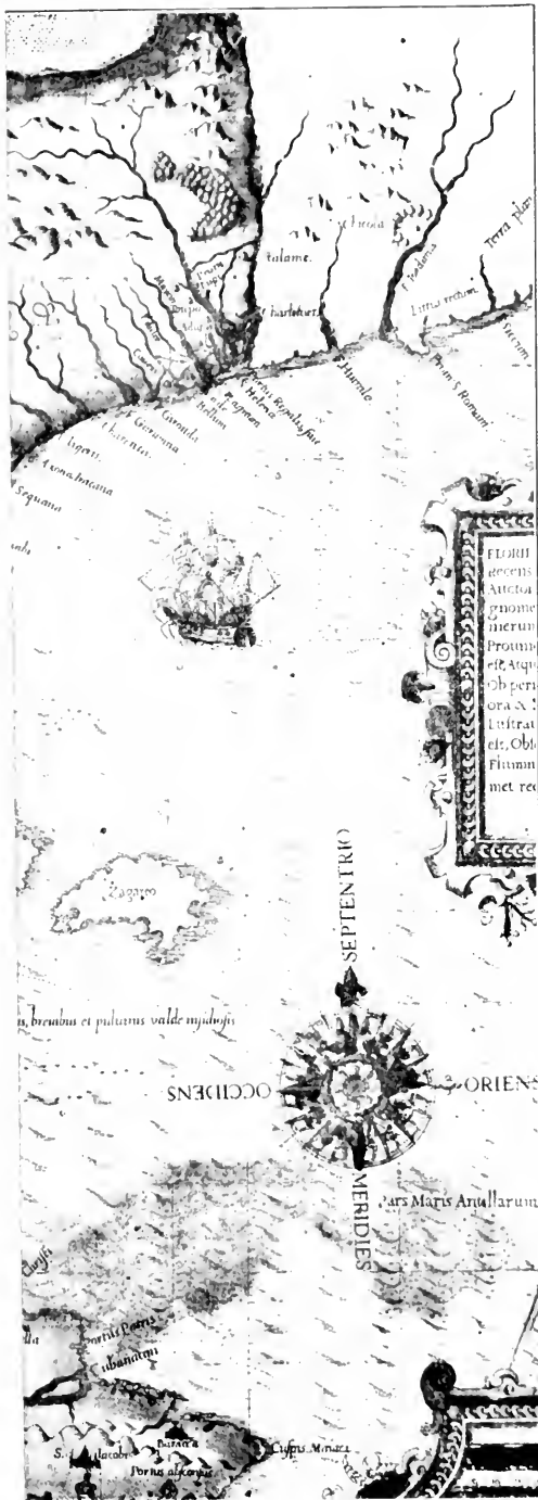
DE MORGUES, PUBLISHED BY DE BRY IN 1591.